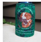
Stubbie Holder AU$15.00