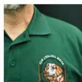
Polo Shirt AU$50.00